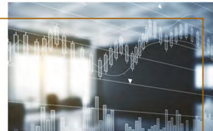
Advertising, Marketing, PR