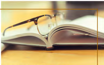
Education & Training